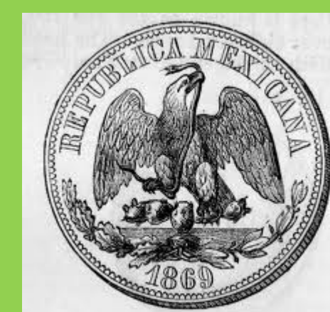
1869 Mexican peso